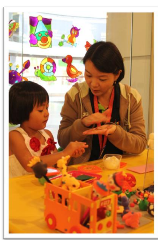
Caption: The art and craft instructors at Jumperzillas constantly explore new ways to engage their little guests